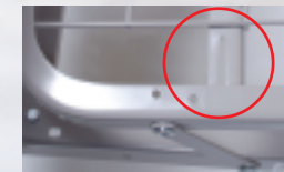
Patent pending rail slot